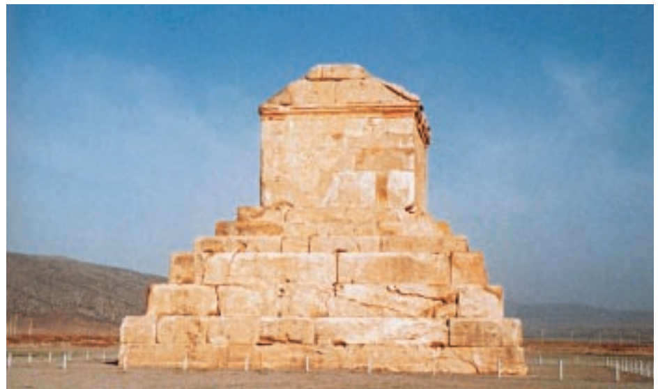
The Tomb of Cyrus the Great, who founded the Persian Empire around 550 B.C.

“They befriended me. They showed an interest in me. I enjoyed the discussions about life and its meaning. They spoke to me of a God who could be known, a God who forgives sin, a God who is revealed in His Son, Jesus Christ. I didn’t believe it all, then. Indeed, I mocked them. But I was