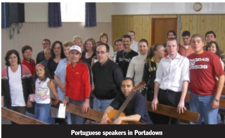
Portuguese speakers in Portadown

Conscious that their potential congregation is fluid (many workers are short-term),