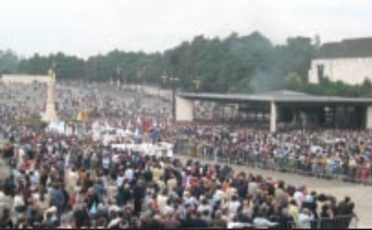
Pilgrimage to Fatima

the south. Much of the focus is upon the famous shrine of Fatima in central Portugal. Many Portuguese have been known to declare their belief in Mary, but not in God, and the annual pilgrimage to Fatima saw half a million people attend in 2004. Portugal presents the same problems as any modern secular society: materialism, pluralism, and all-round indifference to spiritual things. The situation has not been helped by the negative impact of large, Charismatic churches that have come in peddling their message of “wealth and health” and leaving a trail of disappointment and disillusionment in their wake.